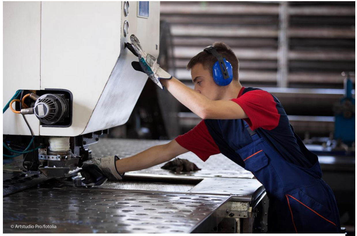
Risky vertical axes can be found in many machines

Monitoring and controlling brakes are part of functional safety technology at KOLLMORGEN